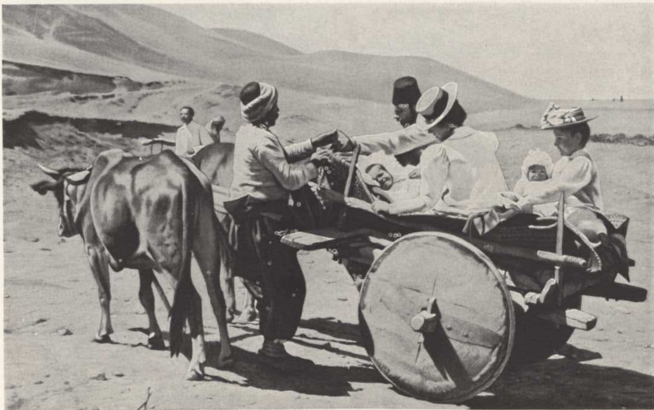
THE MOST COMMON VEHICLE IN ARMENIA

"Armenia is not easy to bound at any period of history, but, roughly, it is the tableland extending from the Caspian Sea nearly to the Mediterranean Sea. Its limits have become utterly fluid; the waves of conquering Persians and Byzantines, Arabs and Romans, Russians and Turks have flowed and ebbed on its shores until all lines are obliterated. Armenia now is not a State, not even a geographic unity, but merely a term for the region where the Armenians live" (see text, page 329; also map, page 359).