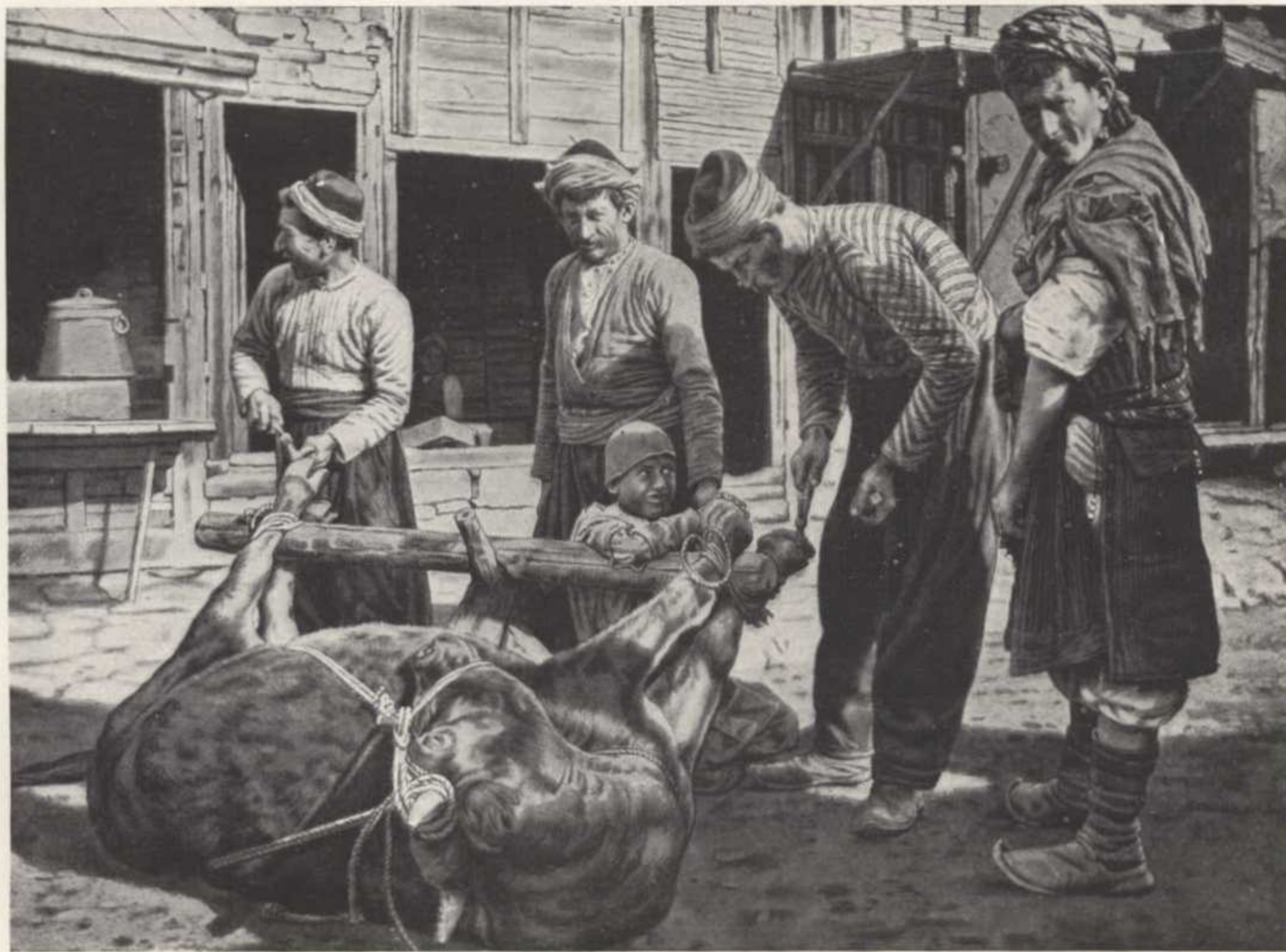
SHOEING AN OXEN ON THE VILLAGE MAIN STREET: VAN