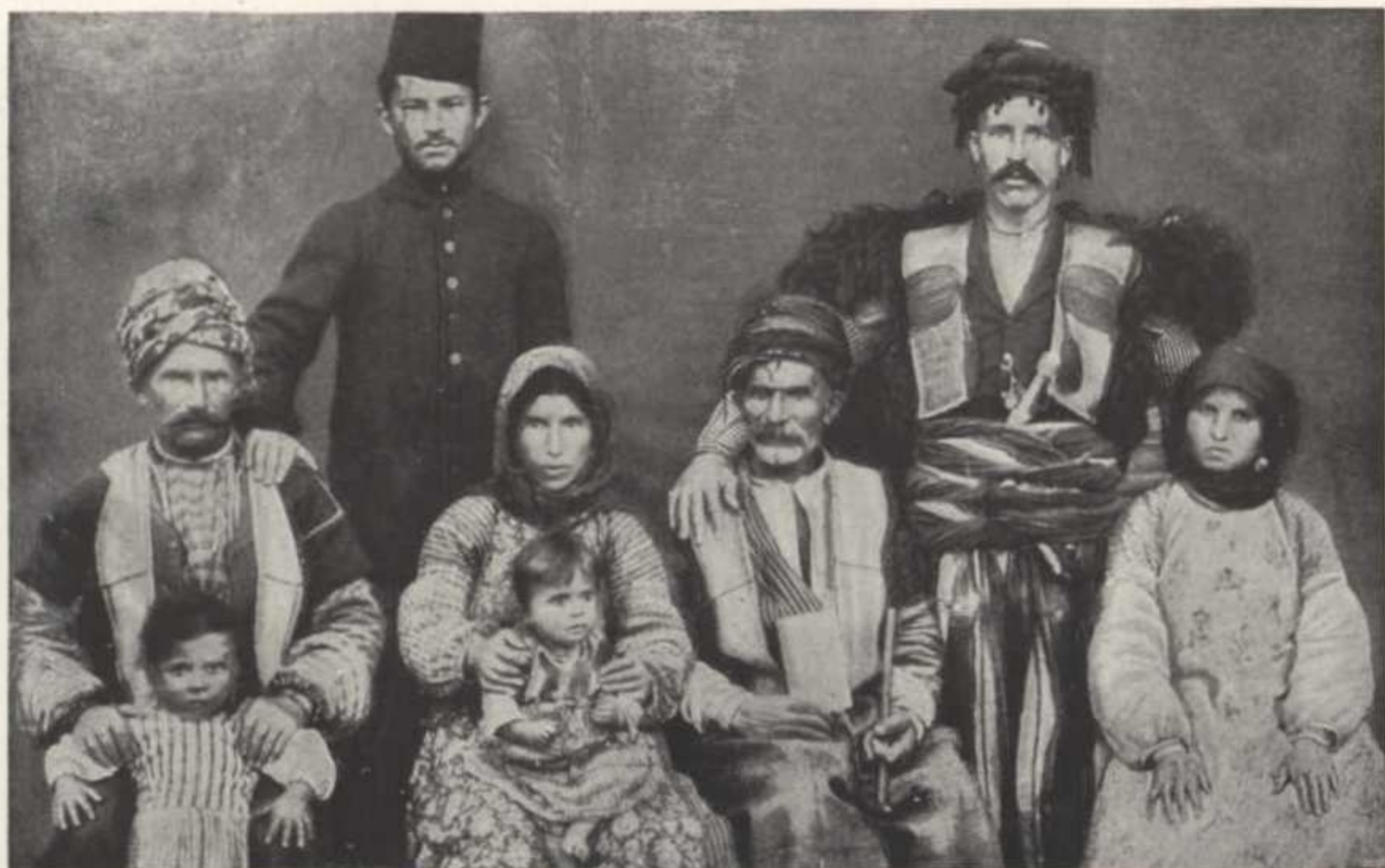
AN ARMENIAN FAMILY OF VAN

"Their appearance is definitely eastern; swarthy, heavy-haired, black-eyed, with aquiline features, they look more Oriental than Turk, Slav, or Greek. In general type they come closer to the Jews than to any other people, sharing with them the strongly marked features, prominent nose, and near-set eyes, as well as some gestures we think of as characteristically Jewish" (see text, page 334).