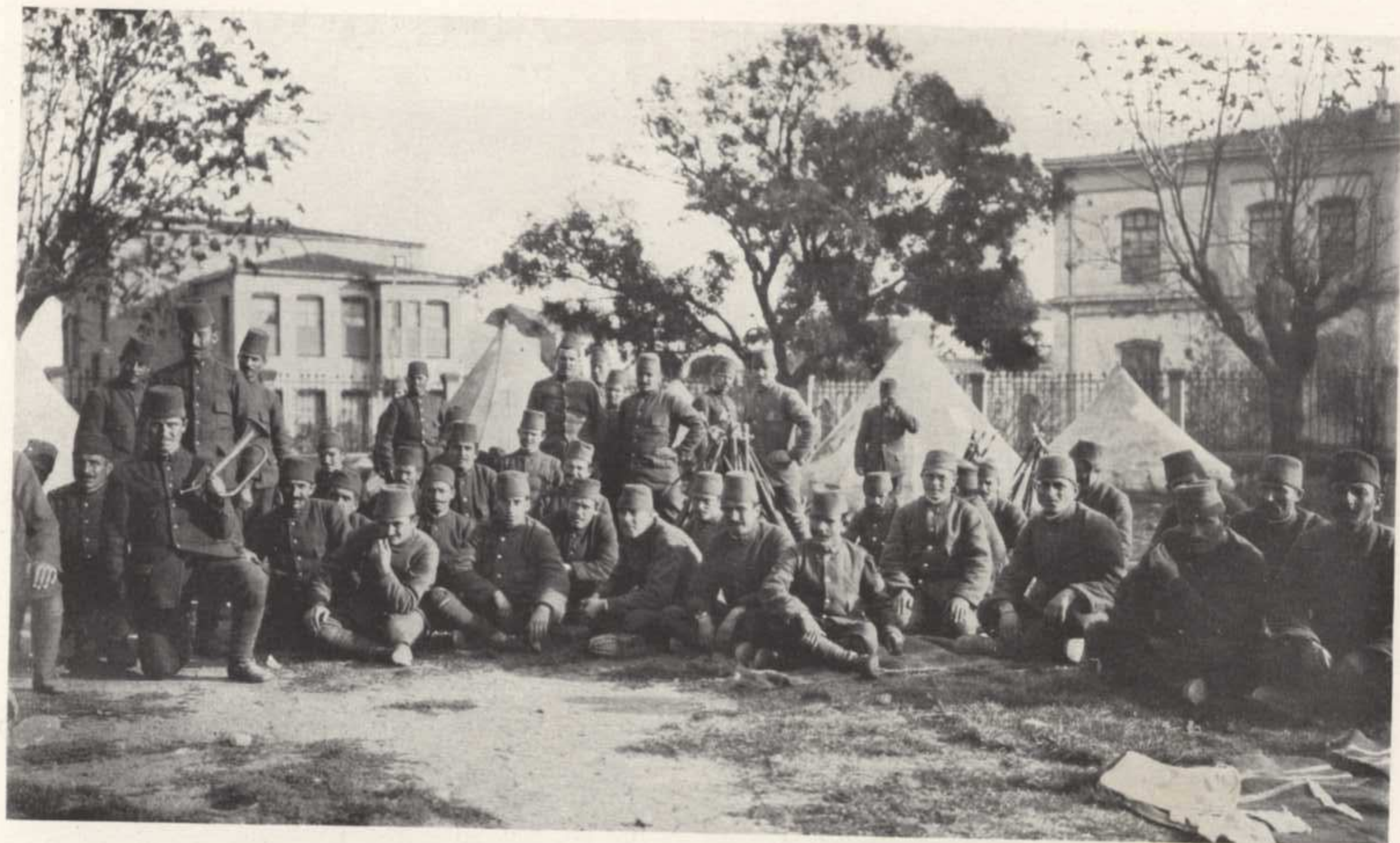
IN CONSTANTINOPLE ALL PARKS AND OPEN PLACES ARE NOW USED FOR THE MILITARY