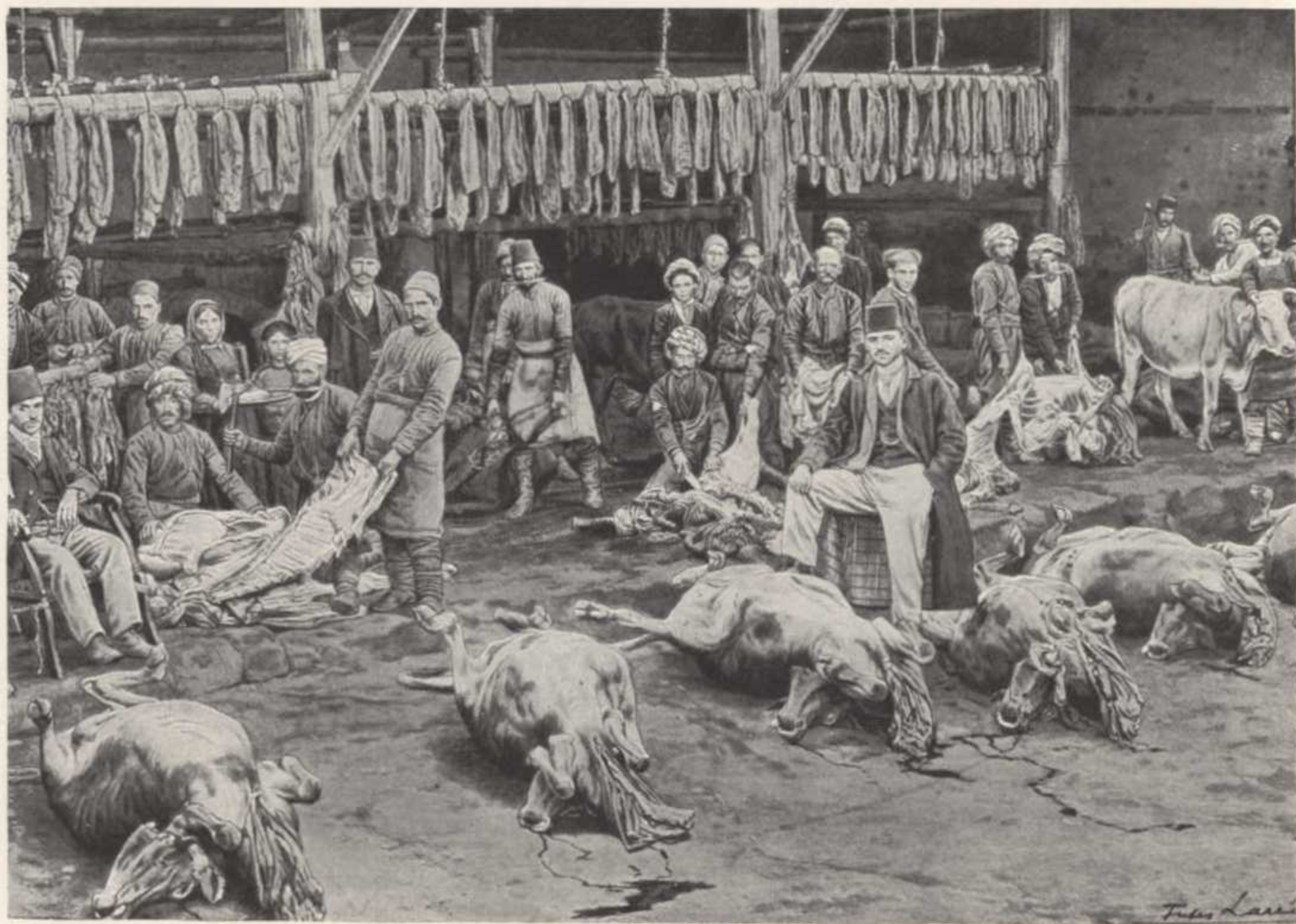
ARMENIANS PREPARING "BASTOURME," BEEF DRIED IN THE SUN, NEAR VAN