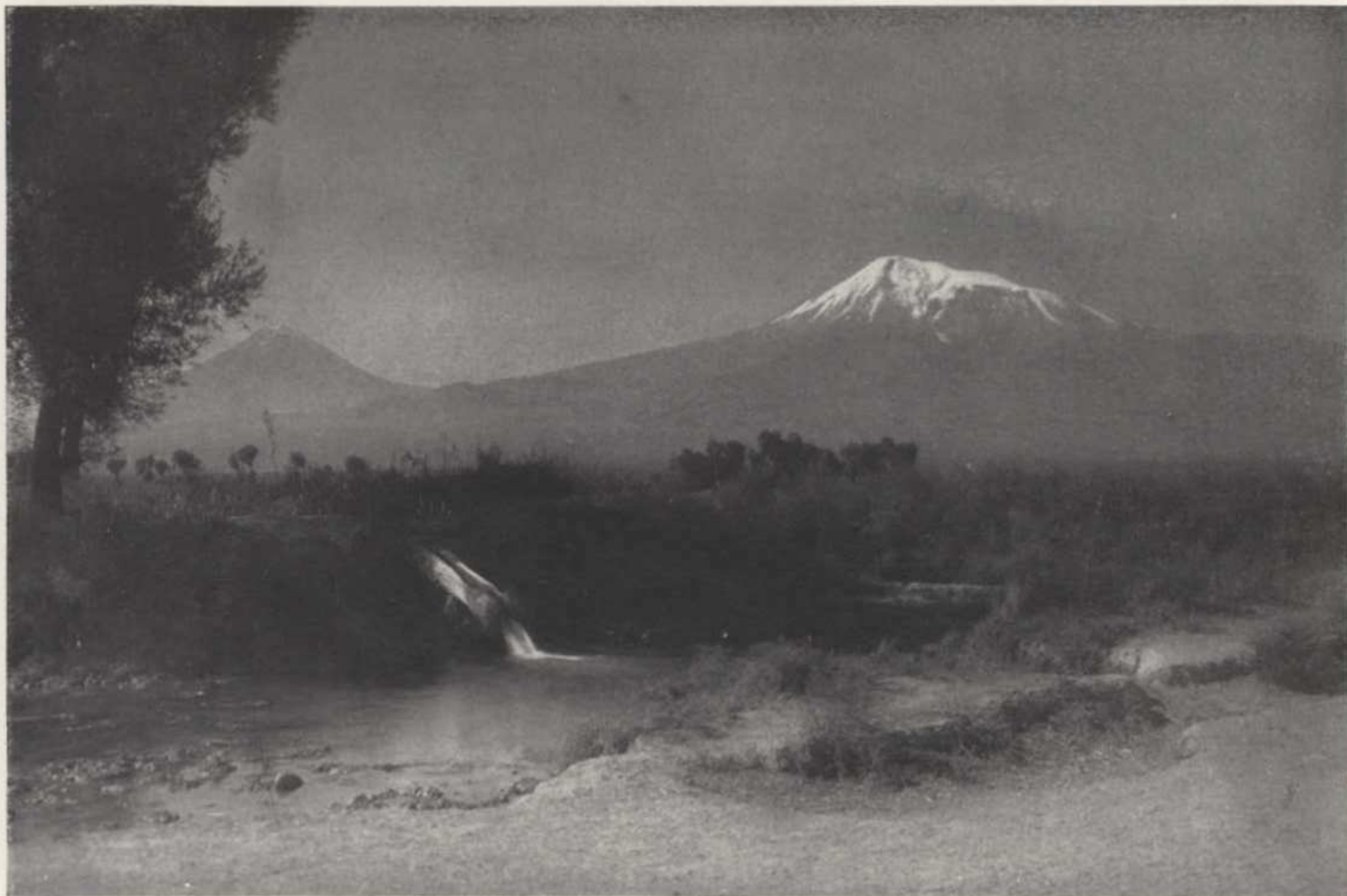
THE MOST FAMOUS OF MOUNTAINS, MOUNT ARARAT IN ARMENIA