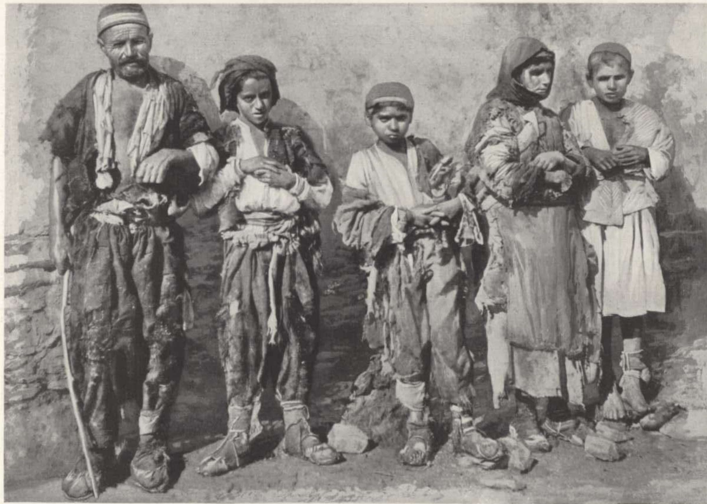
AN ELOQUENT PICTURE OF POVERTY IN ARMENIA